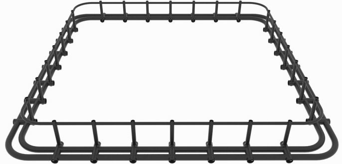
SEA DRAGON (SQUARE)