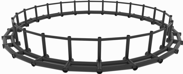
SEA LION (CIRCULAR)