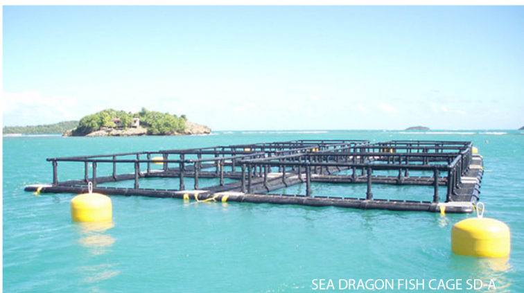
SEA DRAGON FISH CAGE SD-A