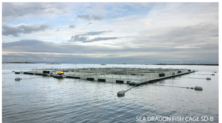
SEA DRAGON FISH CAGE SD-B